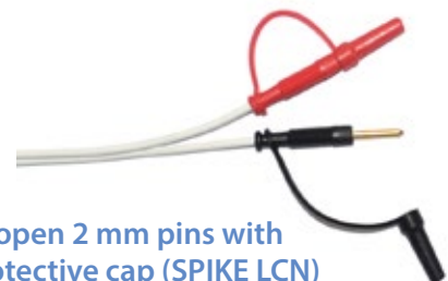
open 2 mm pins with protective cap (SPIKE LCN)