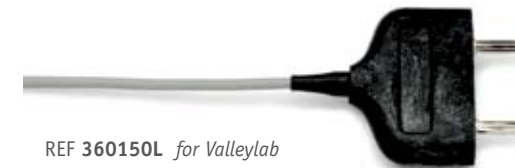
REF 360150L for Valleylab

LiNA bipolar cables available for below ESU generators: